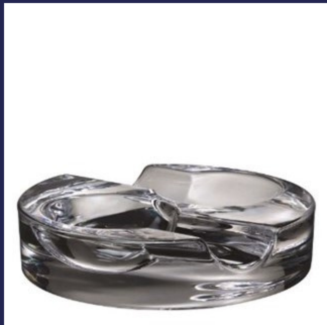
Cigar Ashtray 24356 - 1050746