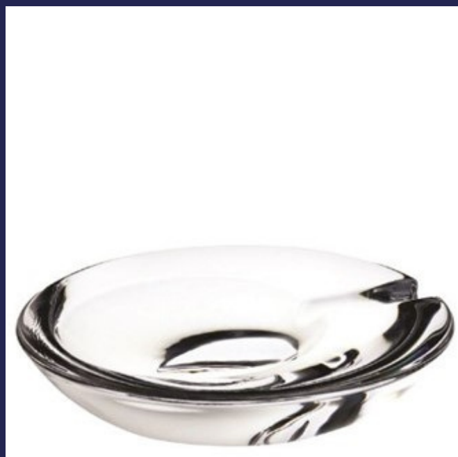
Cigar Ashtray 24029 - 1055519