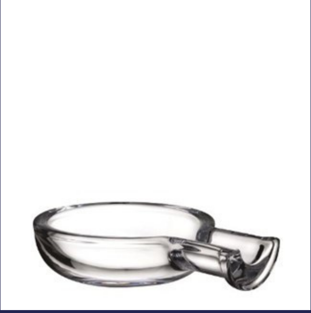
Cigar Ashtray 24357 - 1050742