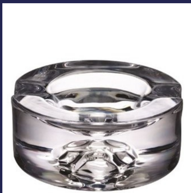
Ashtray 13505 - 288009