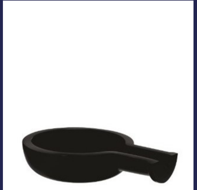
Cigar Ashtray 25020 - 1055505