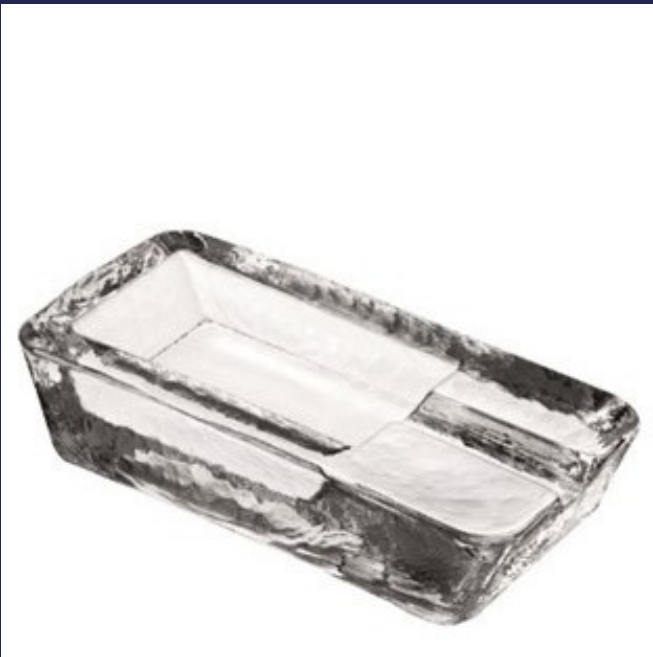
Cigar Ashtray 24105 - 655923