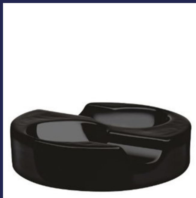
Cigar Ashtray 24106 - 1055058