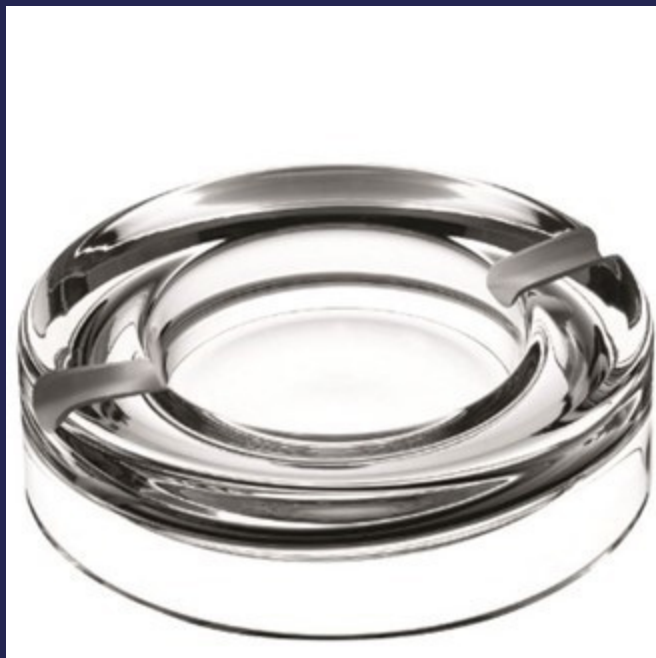
Ashtray 24421 - 1091092